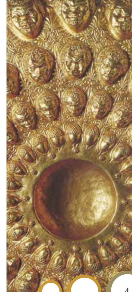
Phiale, Late 4th Century BC, 24k gold, present location: Plovdiv Regional Historical Museum.

Today, social media has provided artists with the opportunity to do what artists have always needed and wanted to do: exchange ideas and study with each other. Now these connections can be made over the internet with remarkable success.