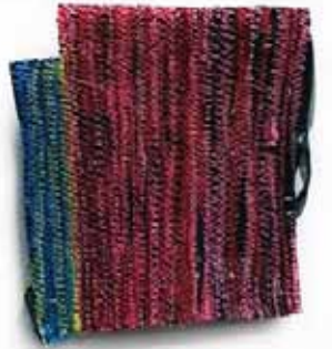
Taeyoun Kim, South Korea, Untitled , 2016, plastic bags (yarn) and thread.